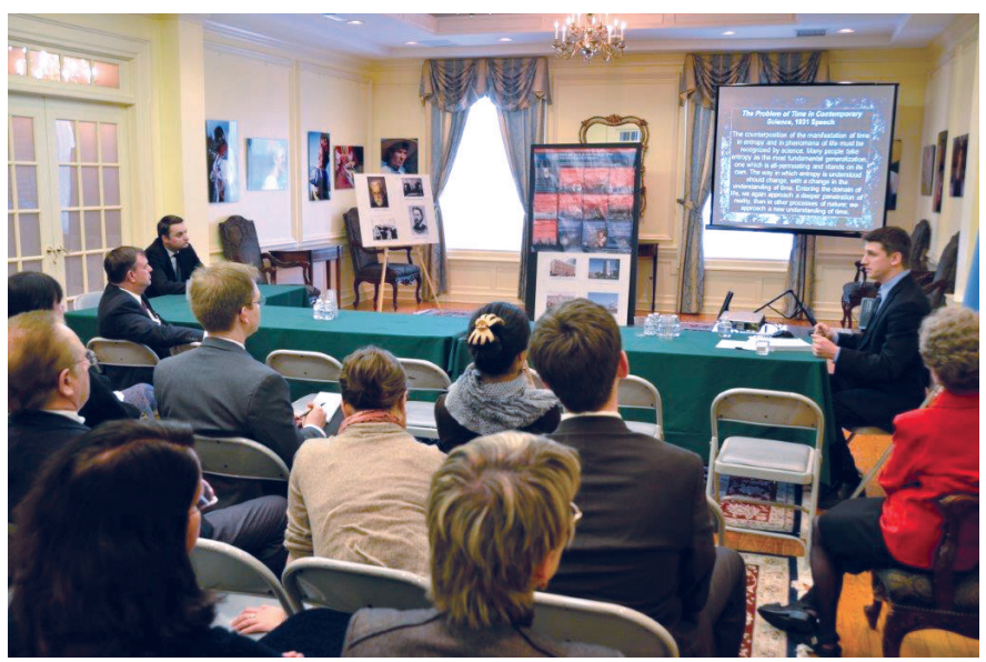
Embassy of Ukrain