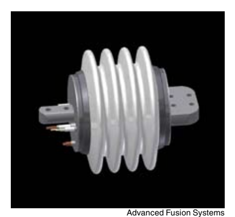
The Bi- Tron^{TM} , devised by Advanced Fusion Systems of New York, is designed for fast bypass of induced currents, within a fraction of an alternating current cycle.

Coronal mass ejections, which may or may not follow a solar flare, are eruptions of plasma, moving charged particles carrying with them a self-generated magnetic field, from the solar corona. A large coronal mass ejection can contain 10 billion tons or more of such material travelling at about 1 percent the speed of light. It is these charged particles, mostly protons and some electrons, which, when aimed at the Earth, produce the ionospheric currents which, in turn, can induce dangerous currents in the electric power grid.