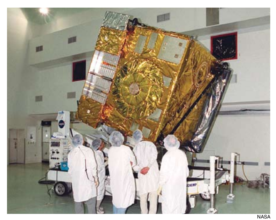
Technicians check the GOES-M satellite before its launch. GOES-M provides weather imagery and quantitative sounding data used to support weather forecasting, severe storm tracking, and meteorological research. It is one of a system of satellites that needs to be maintained if we are to have advance warning of superstorms.

To supply power from "wind farms," requires the construction of an extensive network of 765-kV transmission lines to bring the power from Midwestern states to the major metropolitan areas of the East and West coasts. "This could result in a seven-fold increase of the existing U.S. 765-kilovolt transmission network infrastructure," according to Kappenman, "and it would greatly escalate the vulnerability of the U.S. to geomagnetic storms, as higher voltage transformers are more vulnerable."