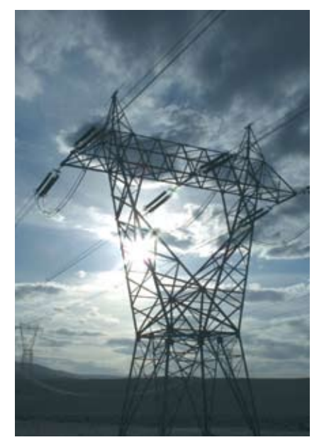
High-voltage transmission lines in Washington state. Higher voltage lines are more susceptible to geomagnetic storm damage.

The greatest danger is to the more than 300 extra-high-voltage (EVH) transformers located at power substations along the routes of major transmission lines. An eruptive event on the Sun, known as a coronal mass ejection (CME), sends a powerful flux of charged particles, protons and electrons, into the surrounding space. If the Earth is on a line with the eruption, the charged particles interact