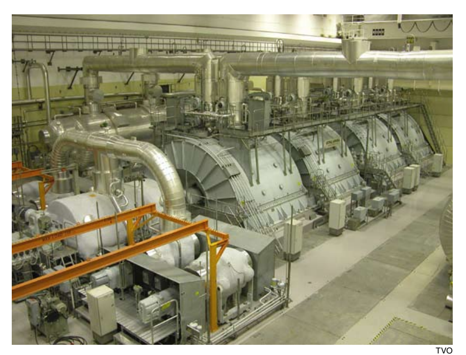
Steam turbine at TVO's Olkiluoto nuclear power plant in Finland. Olkiluoto is a Swedish-built boiling water nuclear reactor, where steam goes directly from the reactor to the turbine.

massive forgings needed for full-sized nuclear pressure vessels, and other large components.