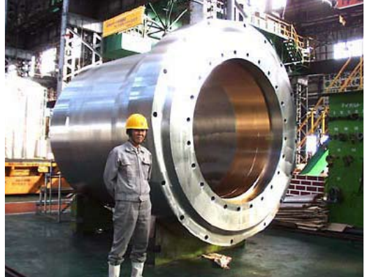
Japan Steel Works

Last June, the accounting firm Ernst & Young released research that had been commissioned by the British government, which similarly found that the cost of financing construction of a new nuclear plant amounts to