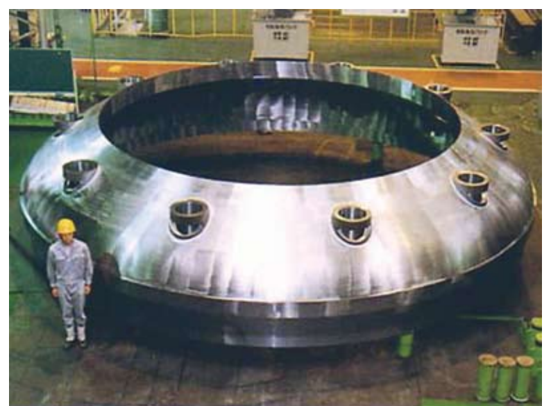
Japan Steel Works

A nuclear pressure vessel component at Japan Steel Works. JSW produces more than 80 percent of the heavy forgings needed for nuclear power plants, and there is a four-year waiting list for its forgings. Pictured is the 80-ton bottom "petal" of a reactor pressure vessel.