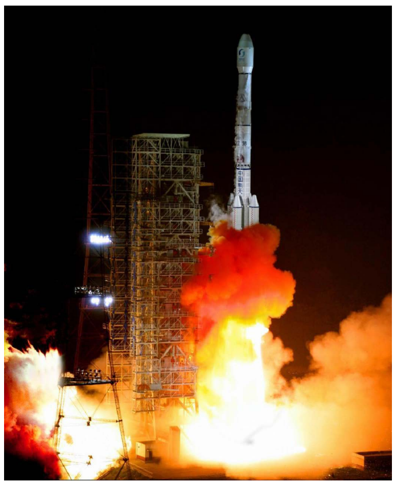
China's Long March 3B Rocket. The next in the series, the Long March 9, is designed to be a super-heavy carrier rocket which can carry 130,000 kg to low earth orbit (LEO). This will break the record set by Saturn V which brought Americans to the Moon.

Returning the planned five pounds of samples of lunar soil and rocks will allow a detailed analysis of the Moon's minerals, chemistry, and other characteristics, which is a necessary step to precede sending people there. Zhang described the activity of a lunar base as setting up agricultural and industrial production, producing medicines in the vacuum environment, and "energy reconnaissance."