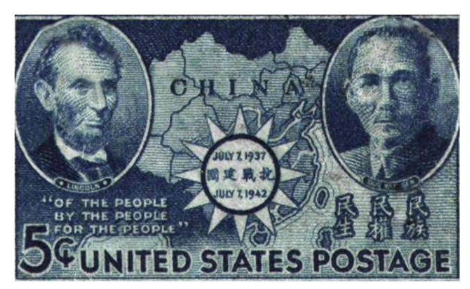
United States Postage Stamp issued July 7, 1942, reflecting the philosophical connection between Lincoln's American System and Sun Yat Sen's vision for China.

its origin in the United States. The bulk of that technology comes out of the scientific and productive potential built up under the leadership of Franklin Roosevelt, and in the echoes of his legacy, as under the Eisenhower and Kennedy administrations, with, for example, the Manhattan Project, Atoms for Peace, and the Apollo missions. It was out of these projects that the world got nuclear power, atomic medicine, and deep-space exploration capabilities, with leading scientists from around the world emigrating to America to participate in the advancement of human progress.