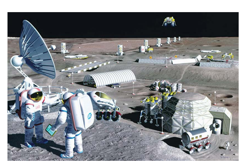
China is leading the way into deep space, as can be seen in its manned space and lunar probe missions. Premier Li Keqiang described their purpose as "to explore the origin of the universe and mystery of human life; and second, to make peaceful use of outer space...." Here, an artist's concept of mining (helium-3) on the lunar surface.

This is achieved through a government-directed, long-