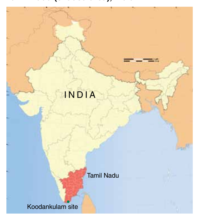
FIGURE 1 Site of the Koodankulam nuclear plant, in Tamil Nadu (shaded area), India

the local media that the U.S. will have to find out the "facts" before commenting on Singh's remarks. Those "facts" remain to be found out.