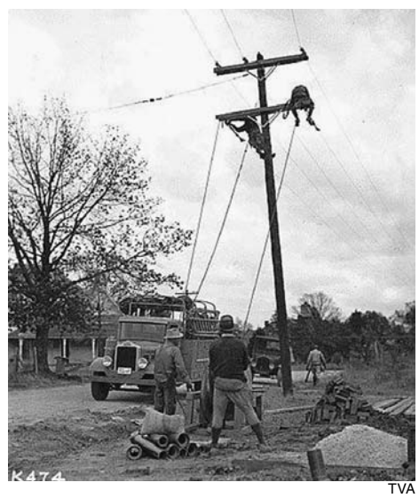
Stringing power lines in the Tennessee Valley. Starting in 1933, the TVA began to bring electricity to all, building 5,000 miles of transmission lines each year from 1938 to 1942.