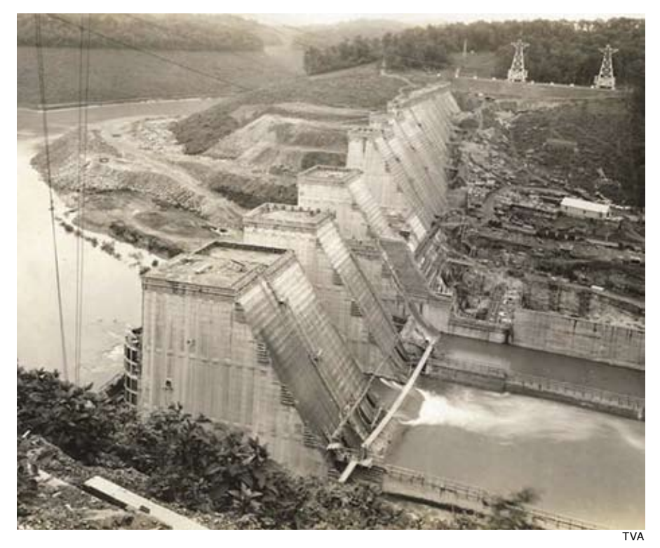
Shovels were in the ground to start construction of Norris Dam less than five months after FDR signed the legislation creating the TVA.

About half the farms in the Valley had electricity by the start of World War II, but most farmers did not know what to do with it. The TVA sent out convoys of trucks, with the help of students from area colleges, and set up tents in rural areas to demon-