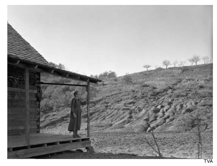
Erosion was widespread throughout the TVA area. More than a million acres of topsoil had disappeared.

dams. This required 113 million cubic yards of concrete, rock, and earth, or 12 times the bulk of the seven great pyramids of Egypt. The TVA employed nearly 200,000 people over the course of its first 20 years, and apprentice programs created skilled craftsman out of sharecroppers, and mechanics out of tenant farmers.