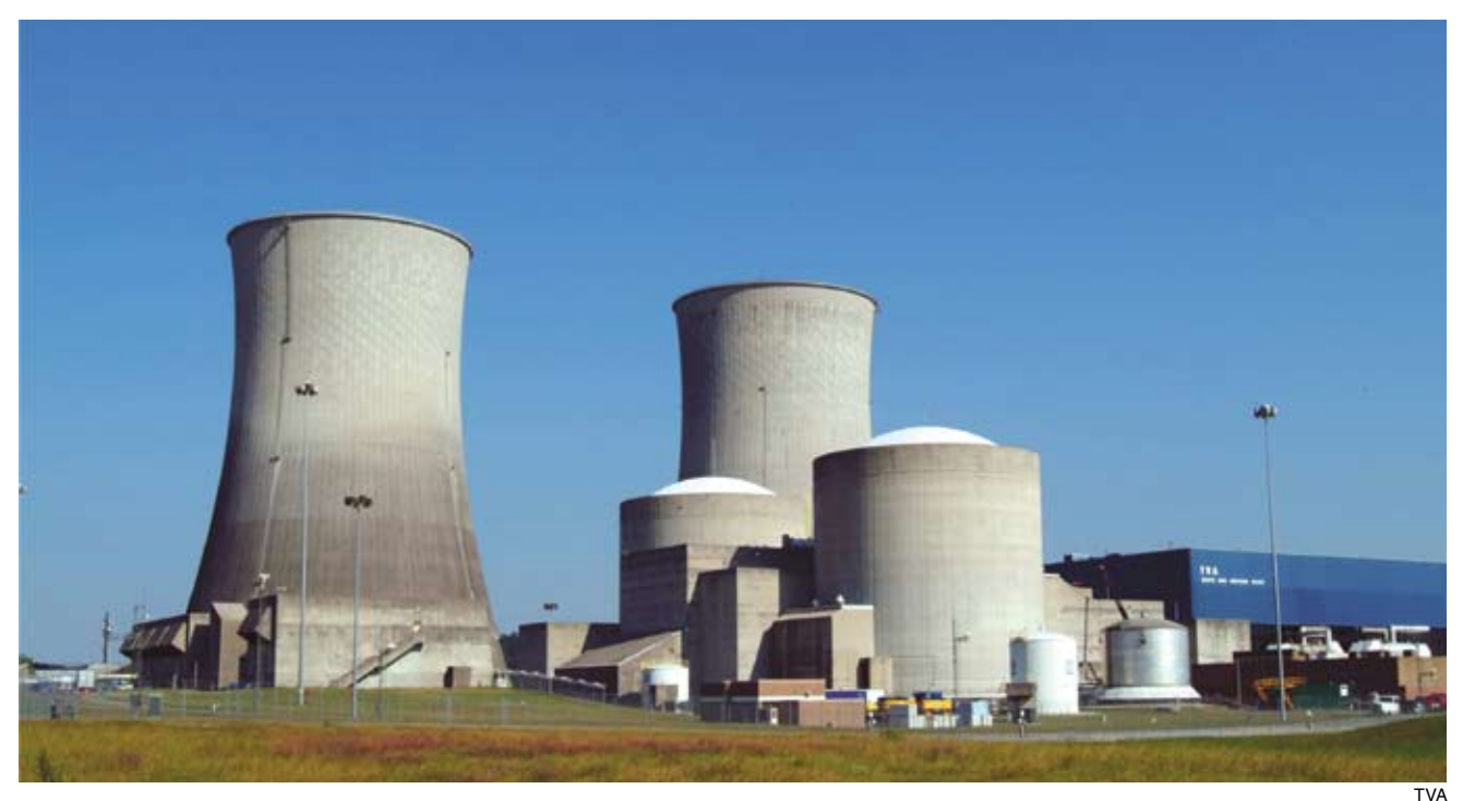
Construction is now under way to bring the uncompleted Watts Bar 2 nuclear plant into operation.

already building reactors. "I really don't know for sure whether nuclear power is safe," he said.