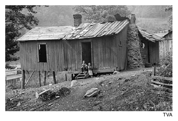
In 1933, the average farmer's income in the Tennessee Valley was $639 per year, about a third of the national average.

less than five months after the President signed the legislation creating the TVA, shovels were in the ground, with the start of construction of Norris Dam on the Clinch River. In its first 20 years, the TVA built 20