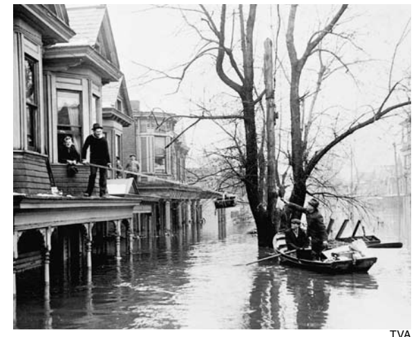
One of the goals of the TVA was flood control.

But unquestionably, the contribution that the dams made to the Tennessee Valley that was felt most by the largest number of people was the provision, for the first time, of electricity. In 1933, only 3 percent of the farms in the Valley had electric power. A year later, the TVA had 18 megawatts of electric generating capacity. By 1942, there was a near order-of-magnitude increase in generating capacity on line-1.37 gigawatts. In 1934, the TVA had 6,507 retail customers. In 1942, there were nearly half a million. There were zero miles of transmission lines being built in 1934. From 1938 to 1942, approximately 5,000 miles were built each year.