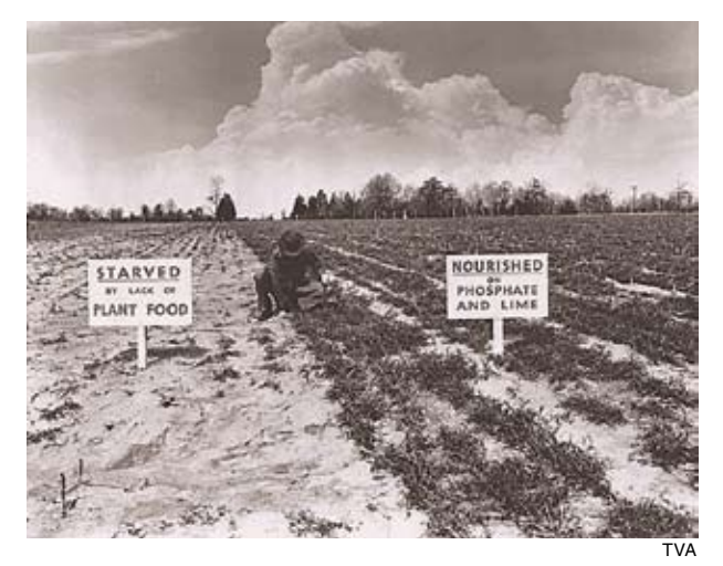
TVA agricultural programs brought Tennessee Valley farmers into the 20th Century. Particularly important was the introduction of fertilizer, which was showcased on demonstration farms and in teaching films. This photo is of a test field, showing its use in producing ground cover.

out in Alabama in 1938, the TVA offered free smallpox shots. By 1951, TVA had inoculated half a million people in the region, helping to produce a regional revolution in public health.