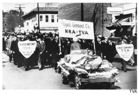
A 1934 parade in Tupelo, Mississippi, to celebrate the city's contract with the TVA for electric power—TVA's first such contract.

But the dams, electricity transmission systems, the new roads, rail tracks, and new towns could not be built with a population suffering from disease. Malaria was attacked by reducing the mosquito population, because there was (and still is) no effective vaccine. By 1934, working with county health departments, the TVA provided typhoid shots at dam work sites, and made the shots mandatory for all TVA employees. After an epidemic of smallpox, one of the biggest killers in the South, broke