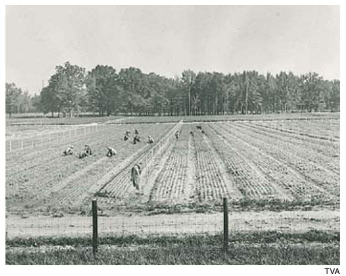
The first CCC group assigned to TVA to concentrate on erosion control and tree planting. By 1944, the TVA had planted more than 150 million trees in the Valley.

Teams of chemists and chemical engineers were assembled to begin operation of a phosphate-based fertilizer production program, to take farming out of the 19th Century. Two hundred TVA experts fanned out across the Valley, to meet with farmers, introducing them to scientifically based modern farming methods. Thousands of demonstration farms were set up, with TVA donating its new phosphate-based fertilizer, and the demonstration farmer opening his farm to share his results with his neighbors. In 1935, TVA produced 24,000 tons of concentrated superphosphate, which grew to