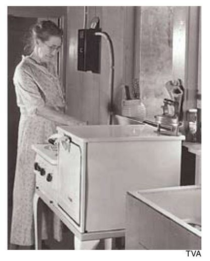
The Electric Home and Farm Authority gave low-interest loans to people in the valley, to help them purchase electric appliances like stoves.