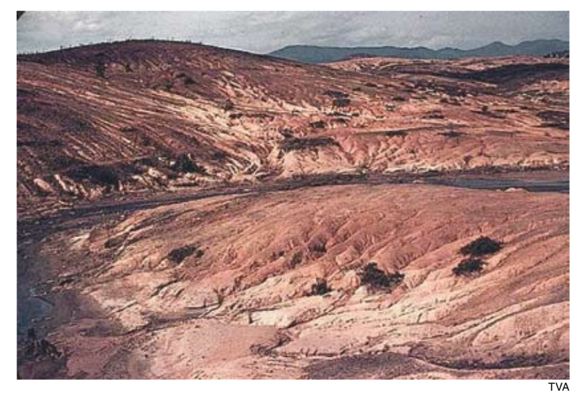
The Copper Basin in southern Tennessee was a desolate desert after 90 years of copper mining killed off vegetation and eroded the land. Today, more than 90 percent of the area has been reforested.

The TVA program had a dramatic impact worldwide. It is estimated that 2-3 billion people, or nearly half the world's population, are alive today because of the development of synthetic fertilizer, more than 70 percent of which was developed at TVA's National Fertilizer Development Center, in Muscle Shoals, Alabama. An investment of $41 million through 1981 returned $57 billion to U.S. agriculture. Fertilizers are responsible for more than a third of U.S. crop production, according