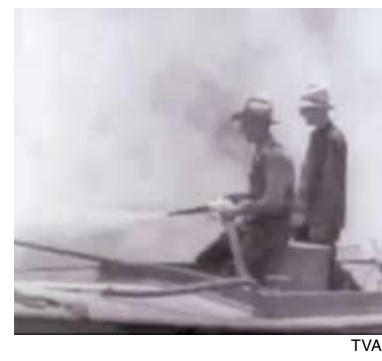
The TVA sprayed against mosquitoes to stop the spread of malaria and inoculated half a million people against smallpox.