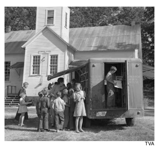
By the late 1930s, the TVA was circulating about 13,000 books a month.