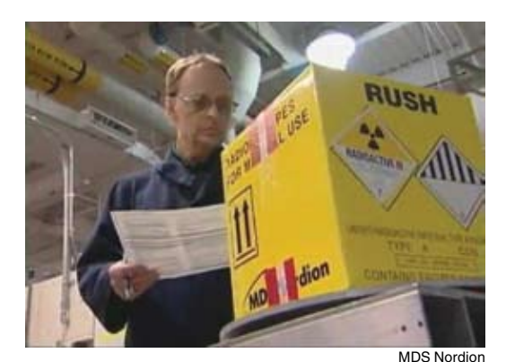
A shipping box for canisters of Mo-99.