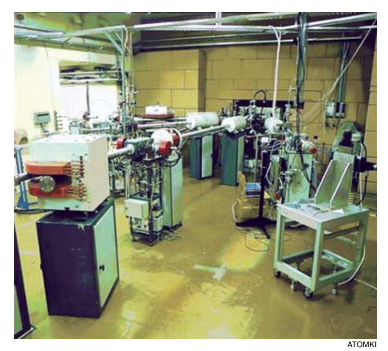
The MGC-20E cyclotron of of Hungary's ATOMKI. Particle accelerators like this one are used to produce the radioisotopes for PET and SPECT imaging.

the increased speed in calculations, where we once needed two hours to treat one patient, we now need only 10 minutes for one patient, thanks to the new cameras using the same isotopes!