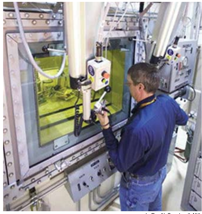
LeRoy N. Sanchez/LANL

shipping, until delivery at the medical facility for use. A major bottleneck is the security clearance of the operatives handling the isotopes at any stage of the process. A second bottleneck is the denial of shipment by captains or drivers who do not wish